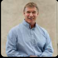
RICK HANSEN Founder, The Rick Hansen Foundation

Rick Hansen, C.C., O.B.C. is a Canadian icon who has dedicated his life to awakening the world to the potential of people with disabilities. He is best known as the “Man In Motion” for undertaking an epic 26-month, 40,000 km journey around the world in his wheelchair. Rick is also a three-time world champion, nine-time Pan Am gold medalist, and six-time Paralympic medalist. He is the Founder of the Rick Hansen Foundation, an organization committed to creating an inclusive world where people with disabilities are living to their full potential.