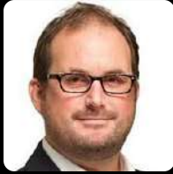
PAUL LEDWELL Deputy Minister of Veterans Affairs Canada

Paul Ledwell was appointed Deputy Minister of Veterans Affairs effective May 25, 2021. He brings extensive experience in government affairs, public policy and research, and organizational strategy, including extensive work with partners in government, private and voluntary sectors and the media.